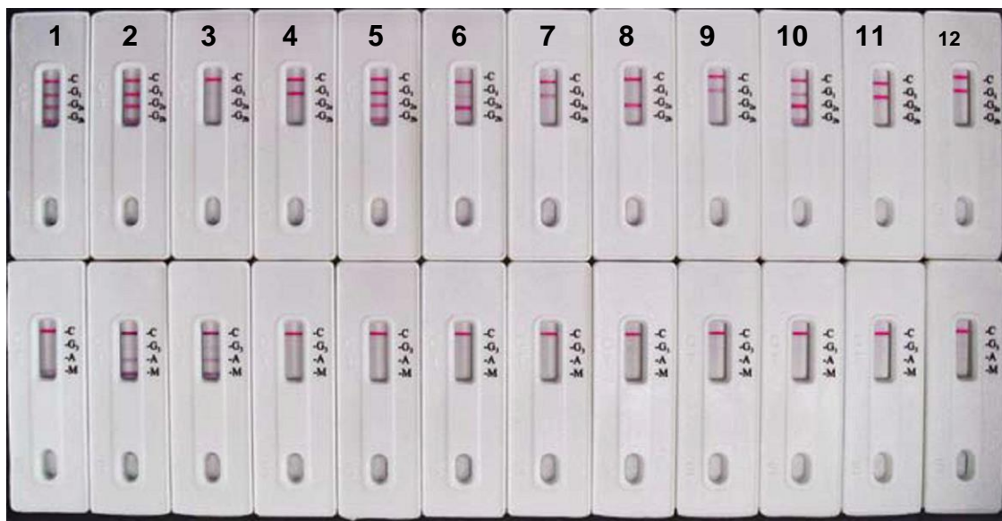
Figure 3. Aviva isotyping kit cassette results.

The data shows excellent correlation between the ELISA-format isotyping assay and the Aviva Isotyping Kit . In addition to the correct interpretation of the isotype, the presence of contaminating antibody present in each monoclonal can be accurately determined with the Aviva Isotyping Kit . Impurities in the form of contaminating isotypes and subclasses correlate well the ELISA data. This demonstrates that the Aviva Isotyping Kit provides the added feature of determining the purity of the monoclonal being tested.